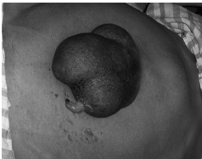
Figure 1. Evisceration of appendix through large umbilical hernia.

1. Amyand C. Of an inguinal rupture, with a pin in the appendix coeci, incrustrated with stone; and some observations on wounds in the guts. Phil Trans Royal Soc. 1736;39:329.