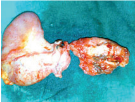
Fig. 2 Photograph shows a specimen of the gallbladder with a choledochal cyst of the cystic duct.