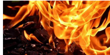
Fire breaks out at warehouse in Kolkata's Bowbazar